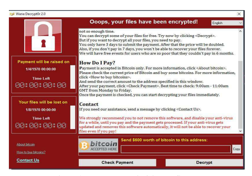
Figure 1: Wana Decrypt0r 2.0 Lock Screen